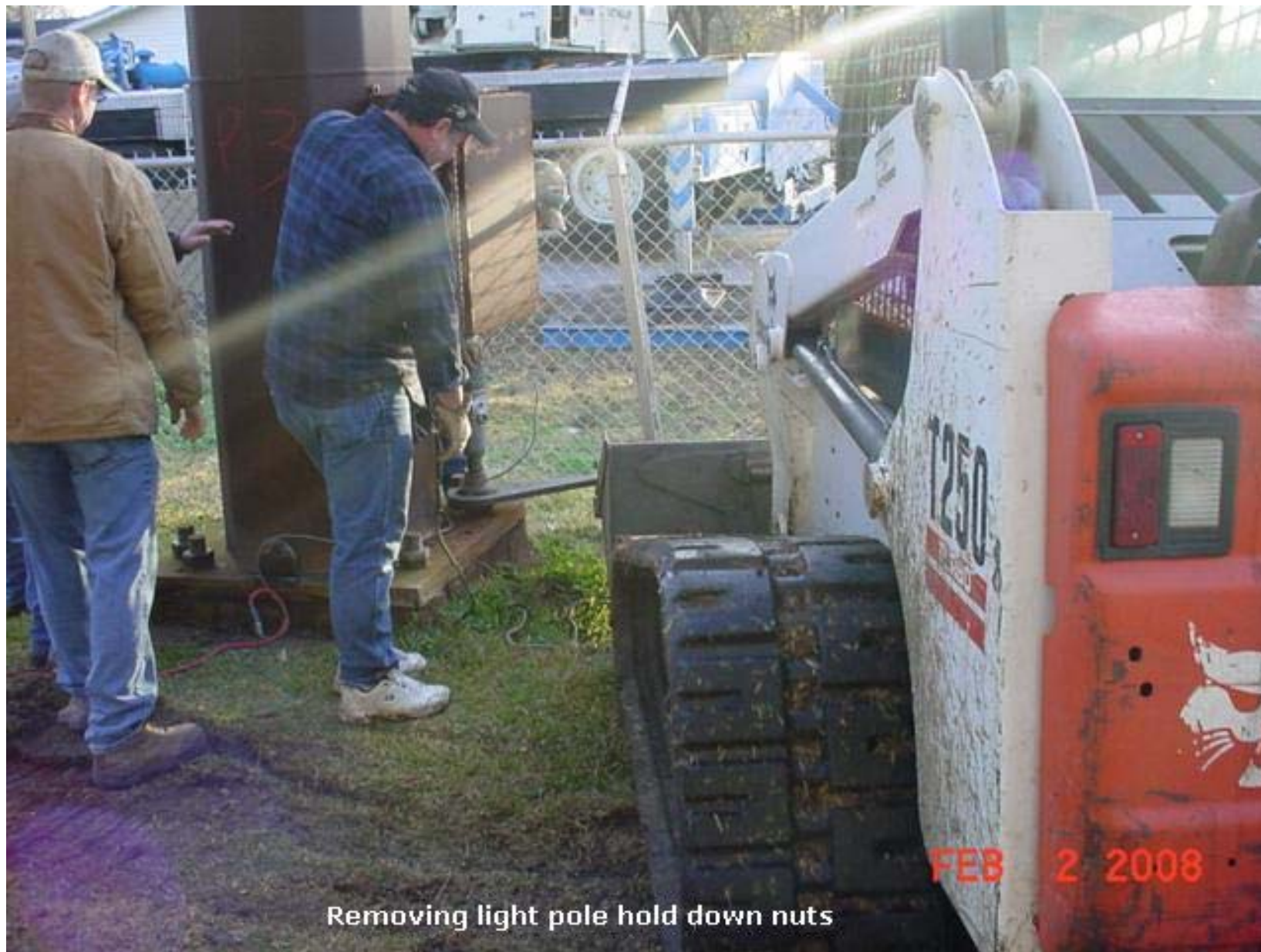
Removing light pole hold down nuts