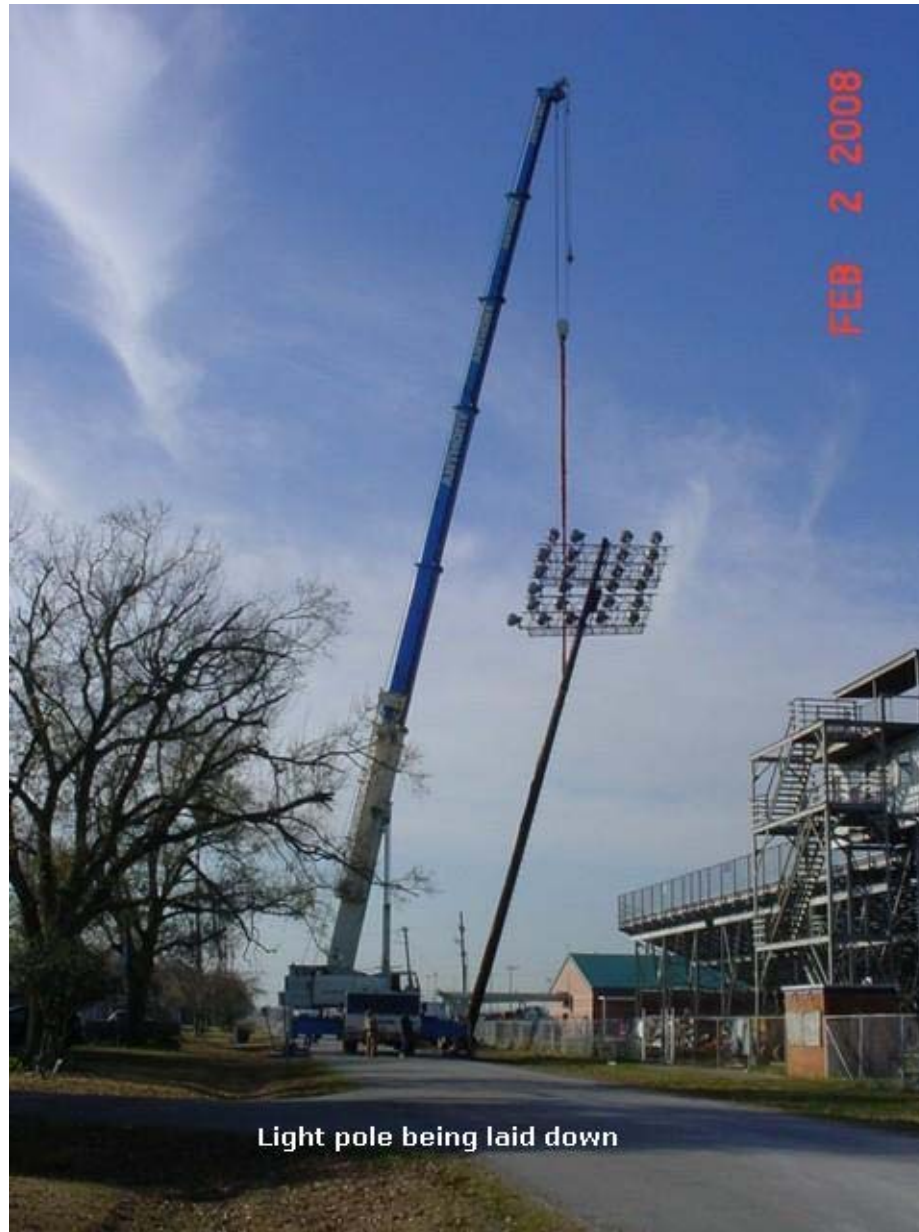
Light pole being laid down