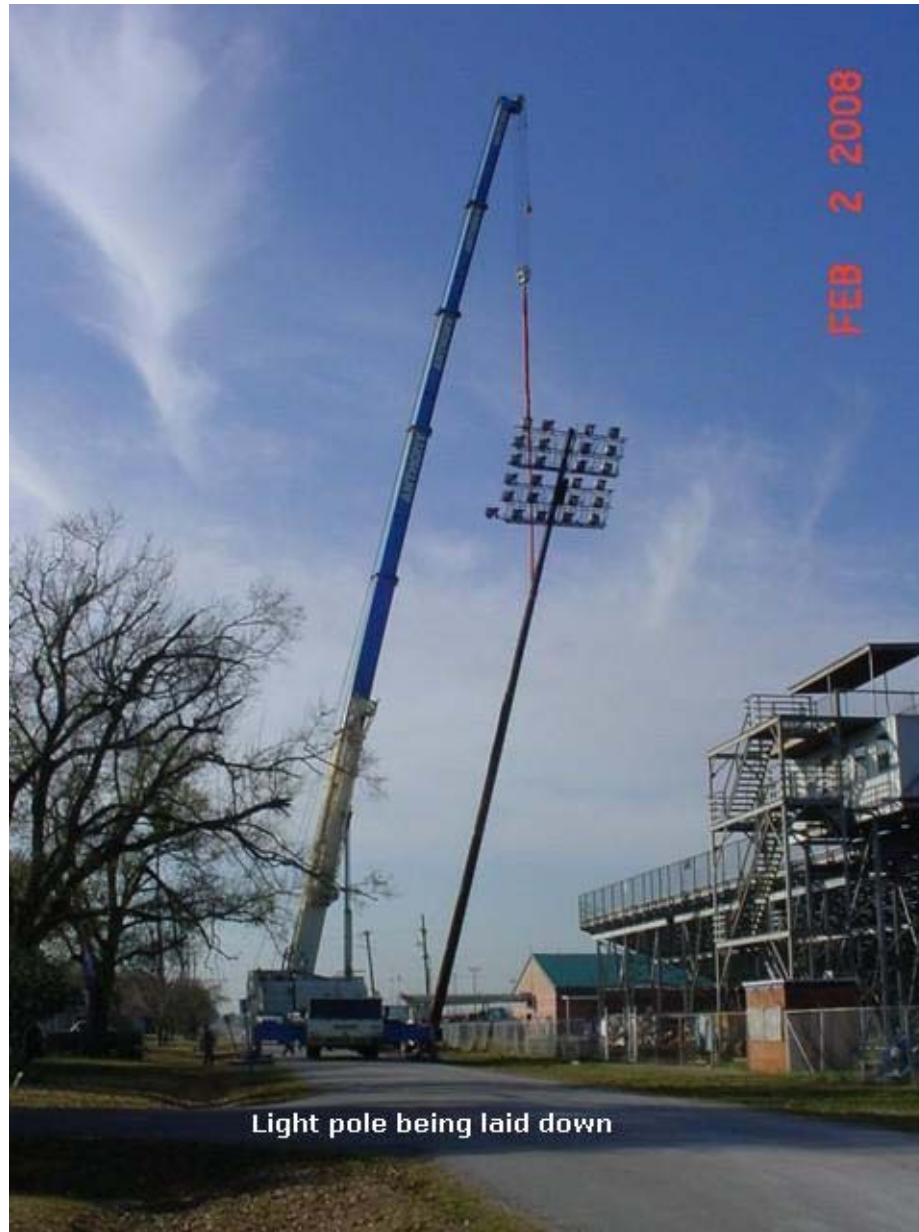
Light pole being laid down