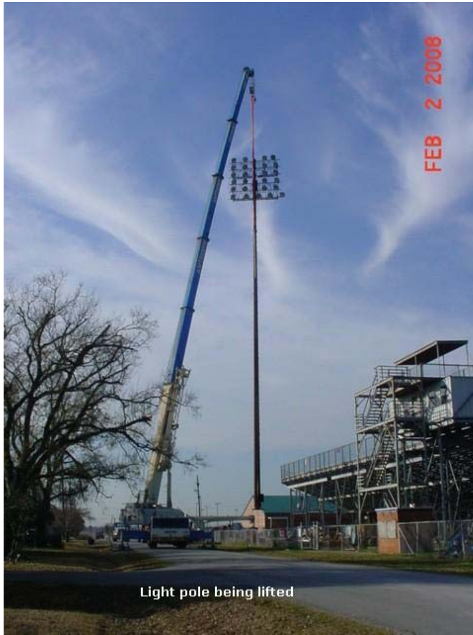
Light pole being lifted