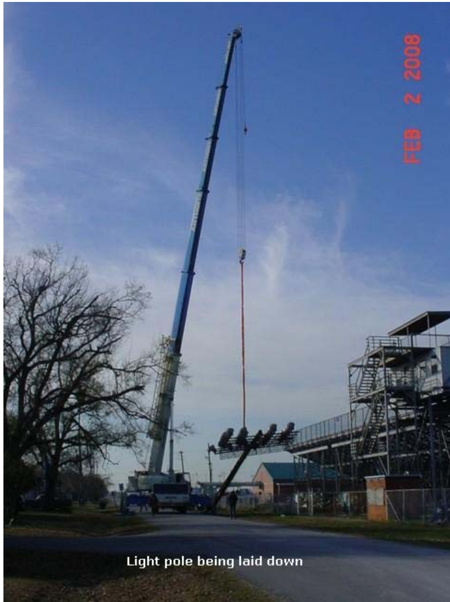
Light pole being laid down