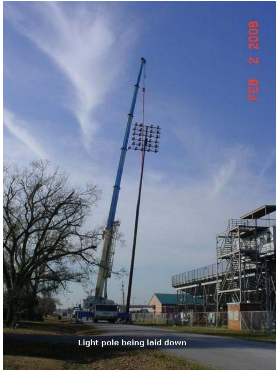
Light pole being laid down