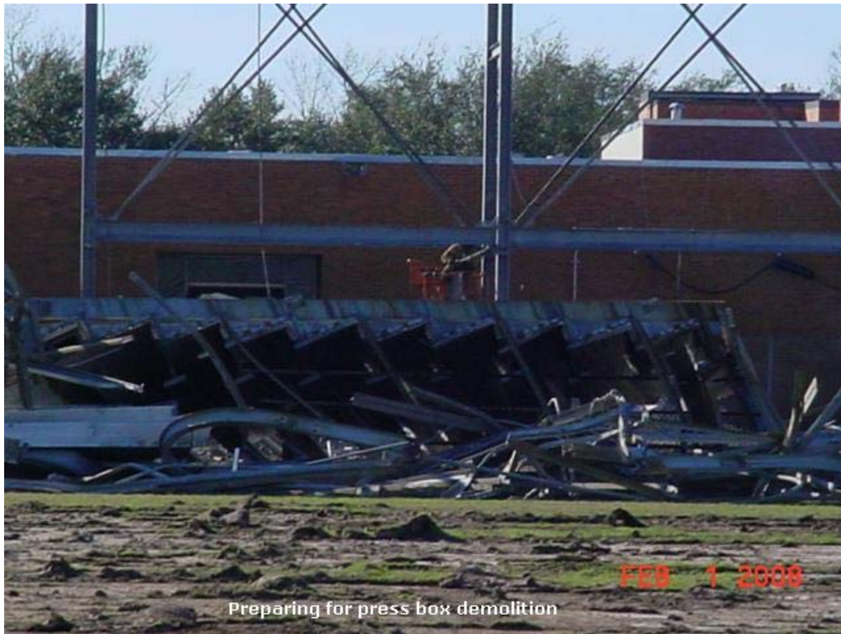
Preparing for press box demolition