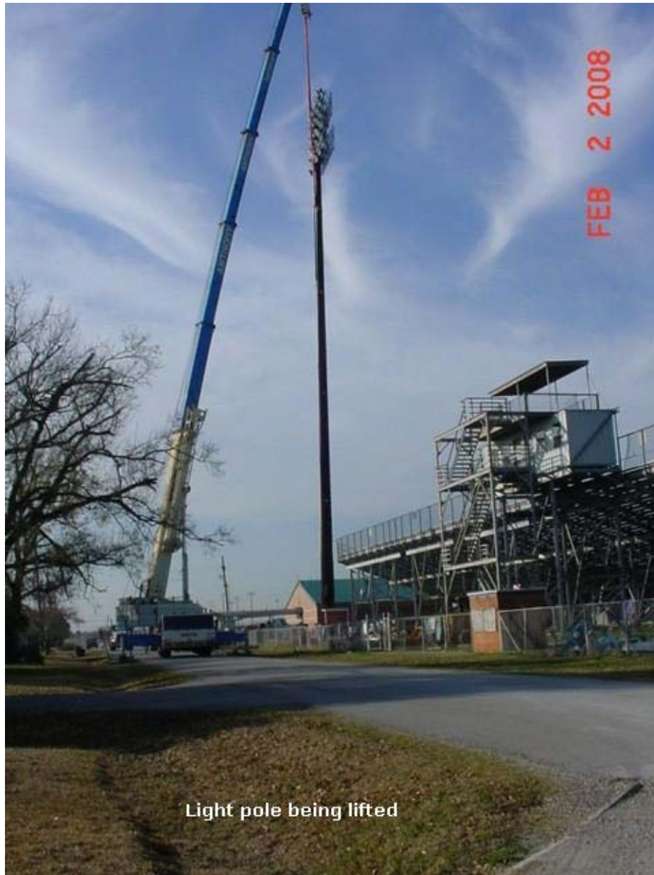
Light pole being lifted