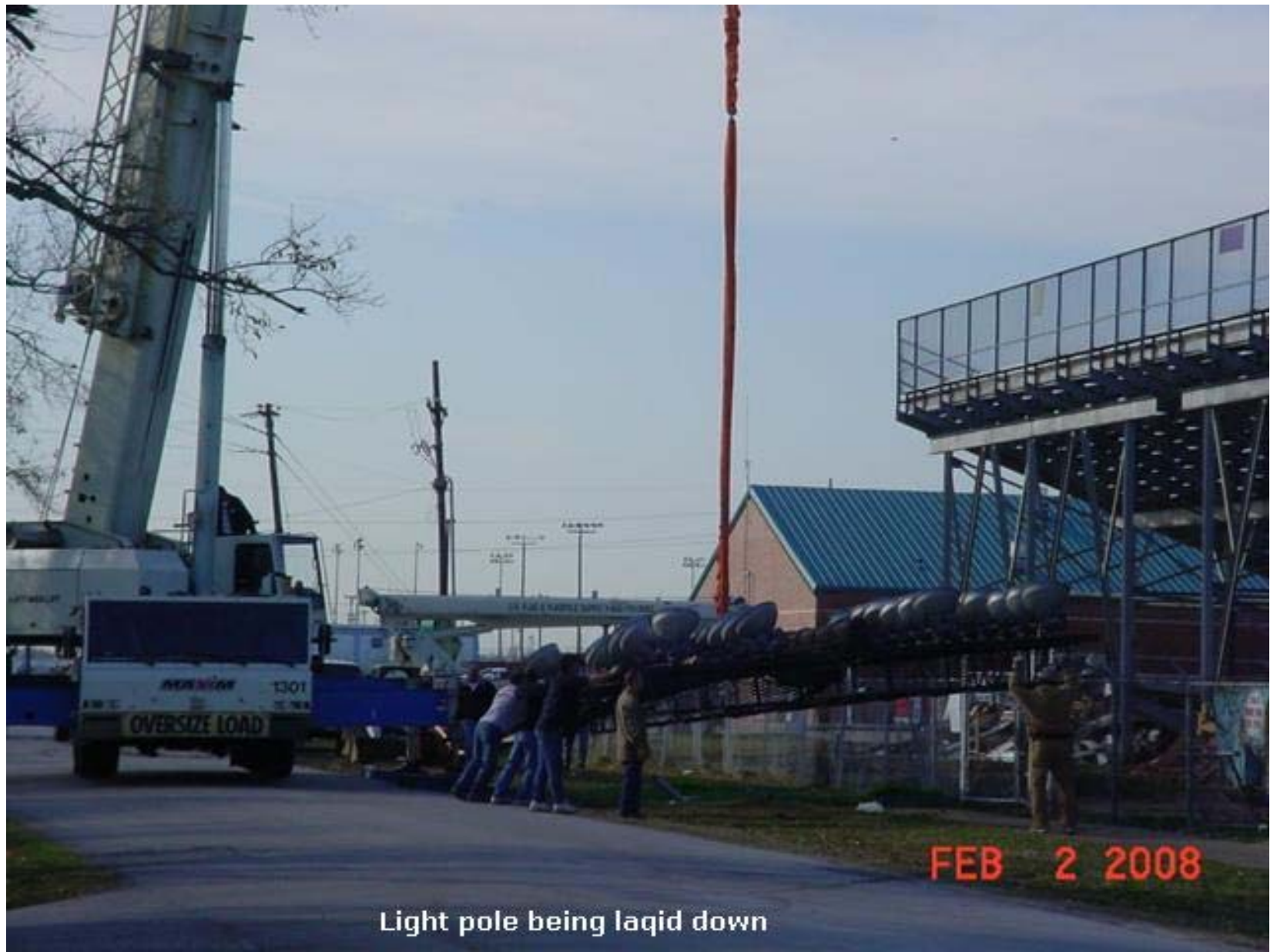
Light pole being laqid down