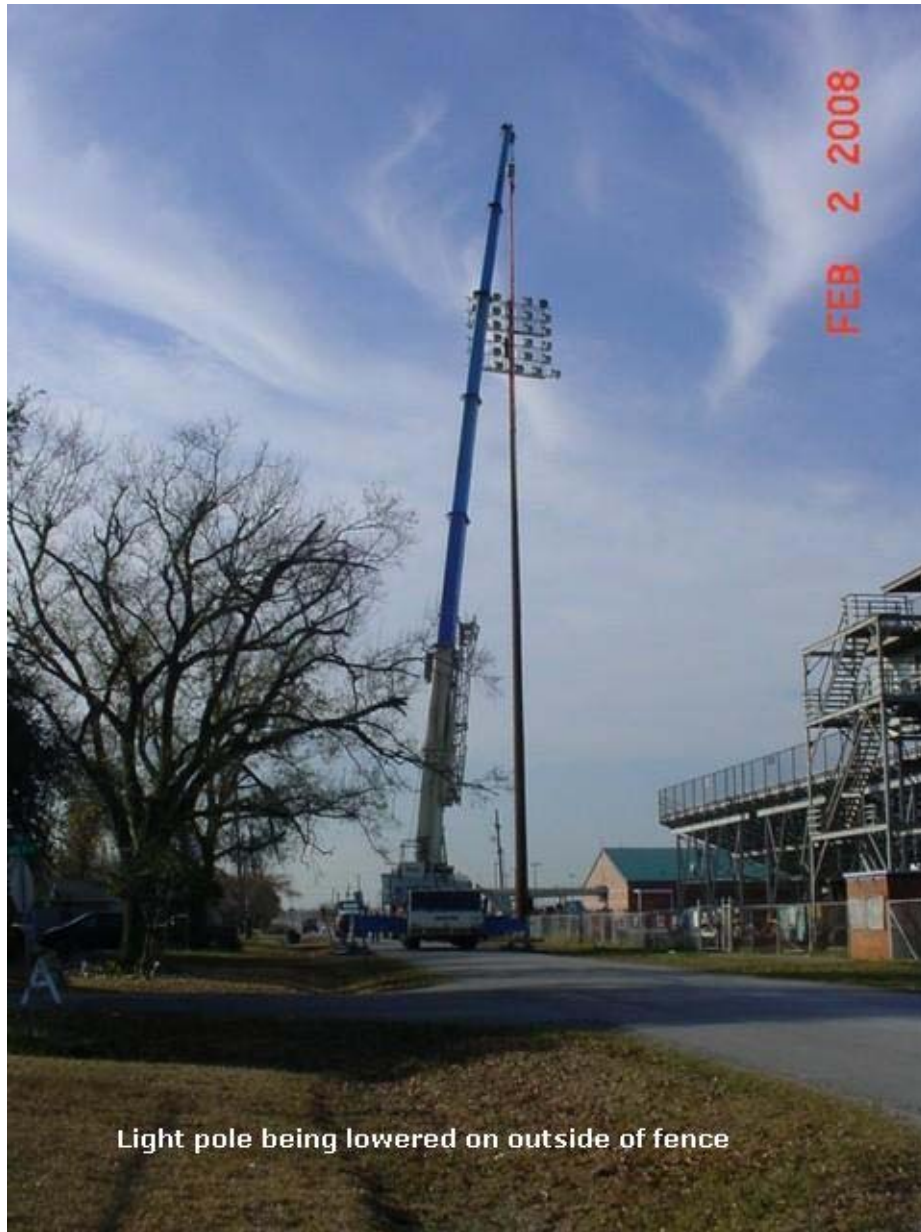
Light pole being lowered on outside of fence