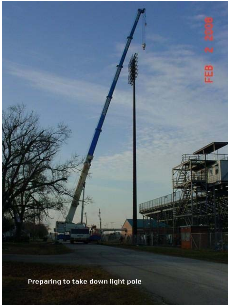
Preparing to take down light pole