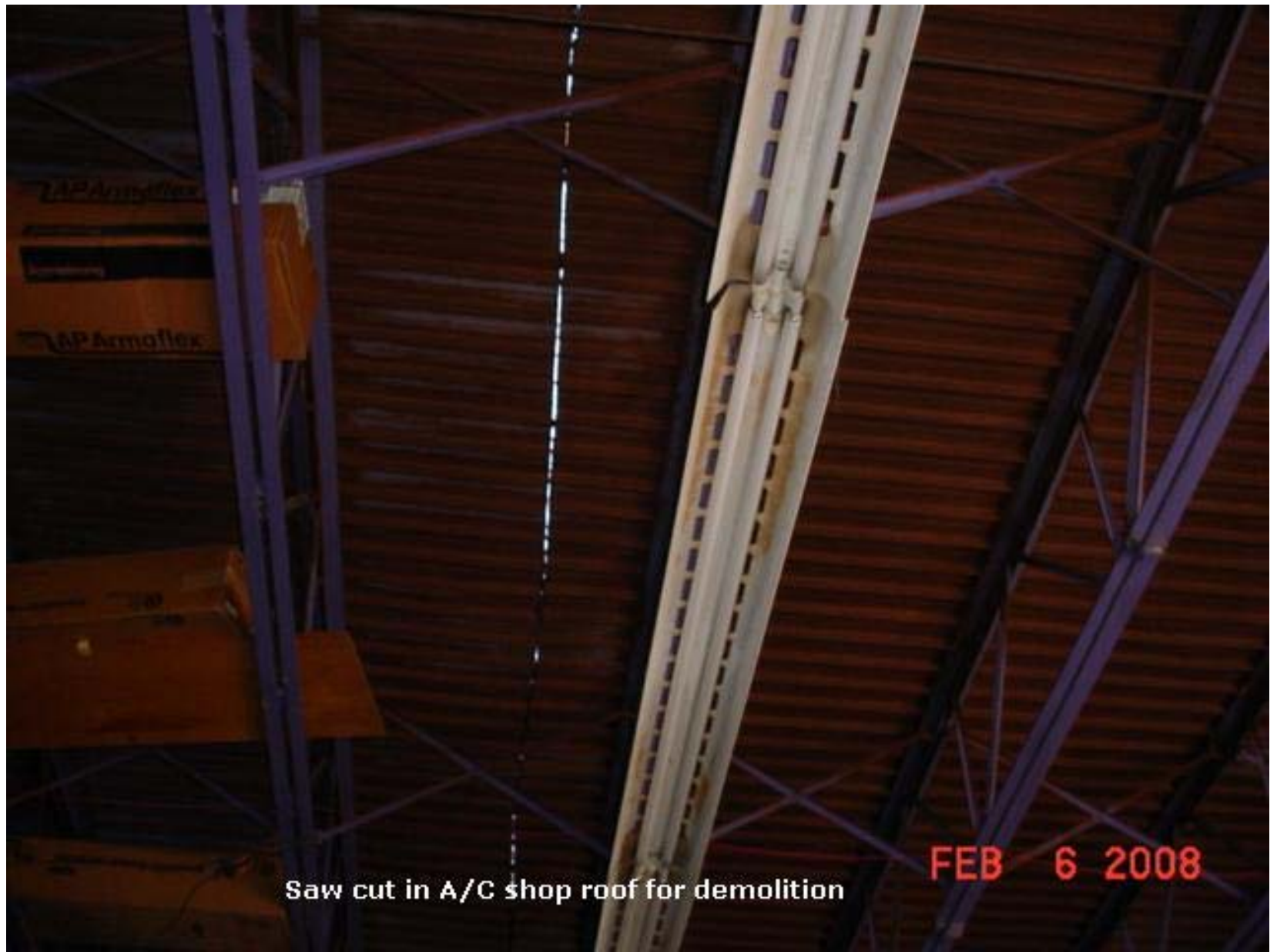
Saw cut in A/C shop roof for demolition