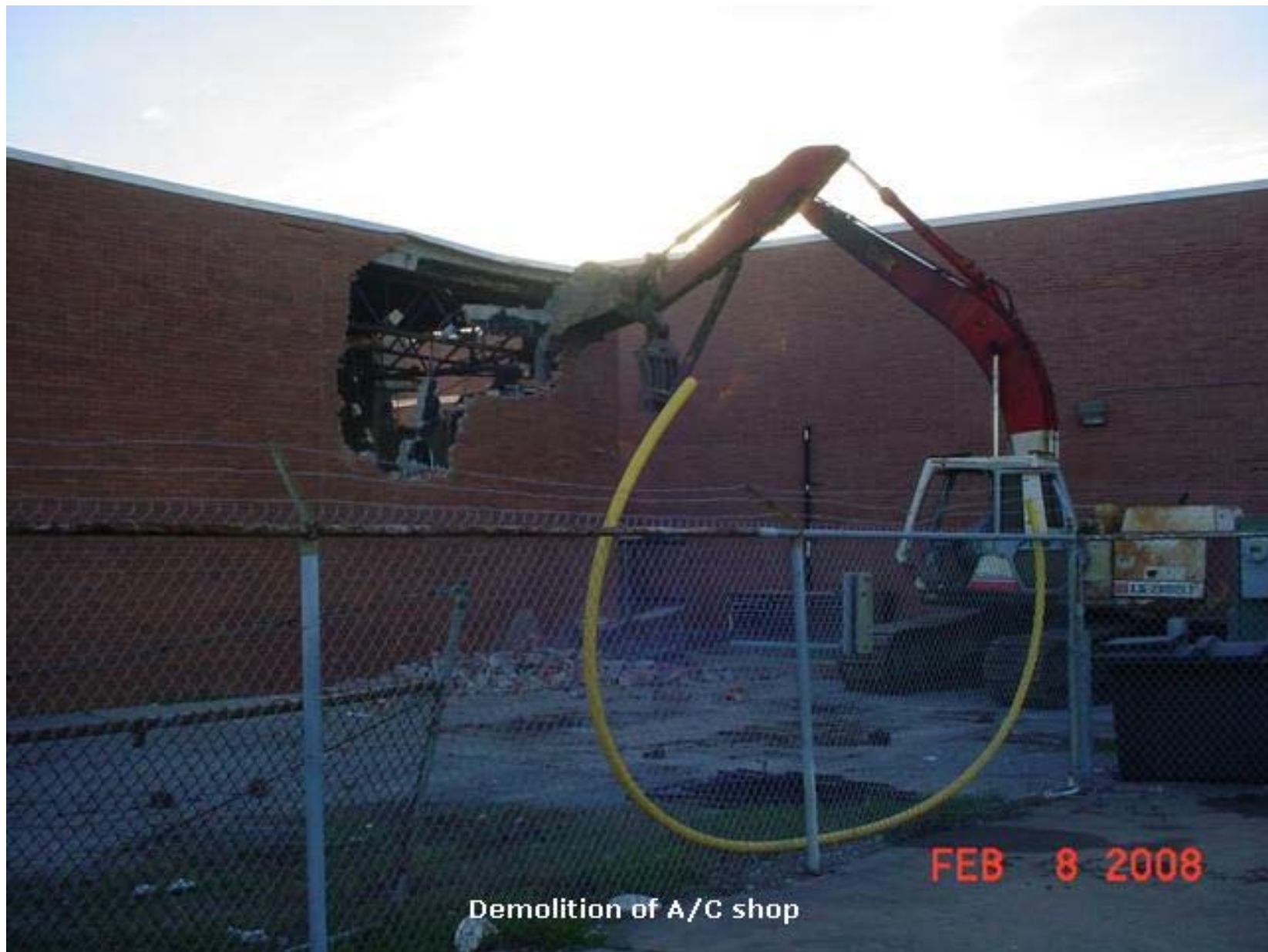
Demolition of A/C shop