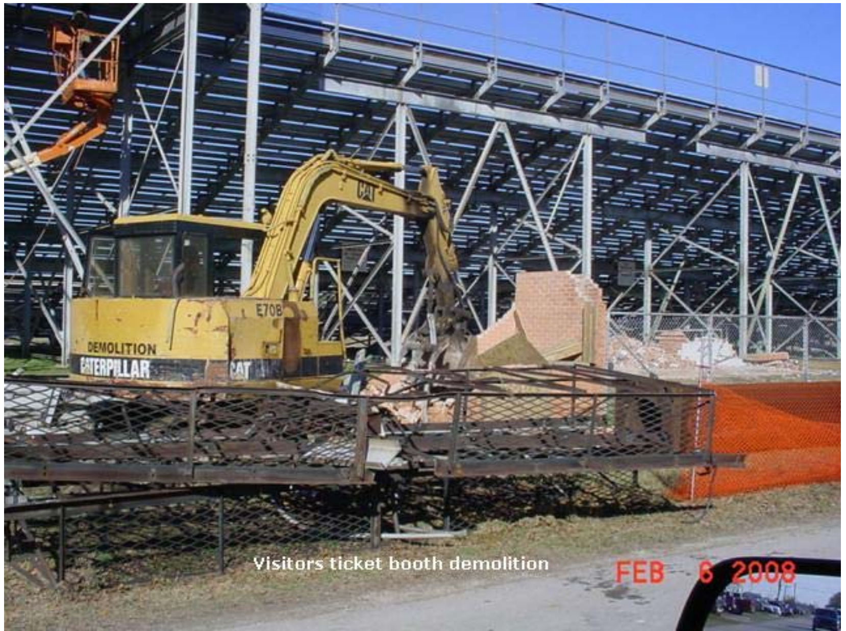
Visitors ticket booth demolition