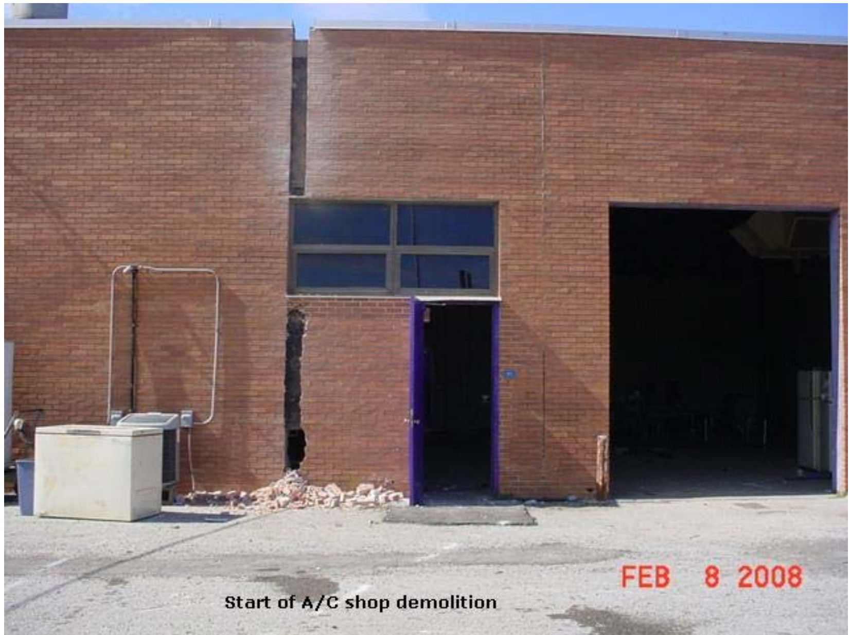
Start of A/C shop demolition