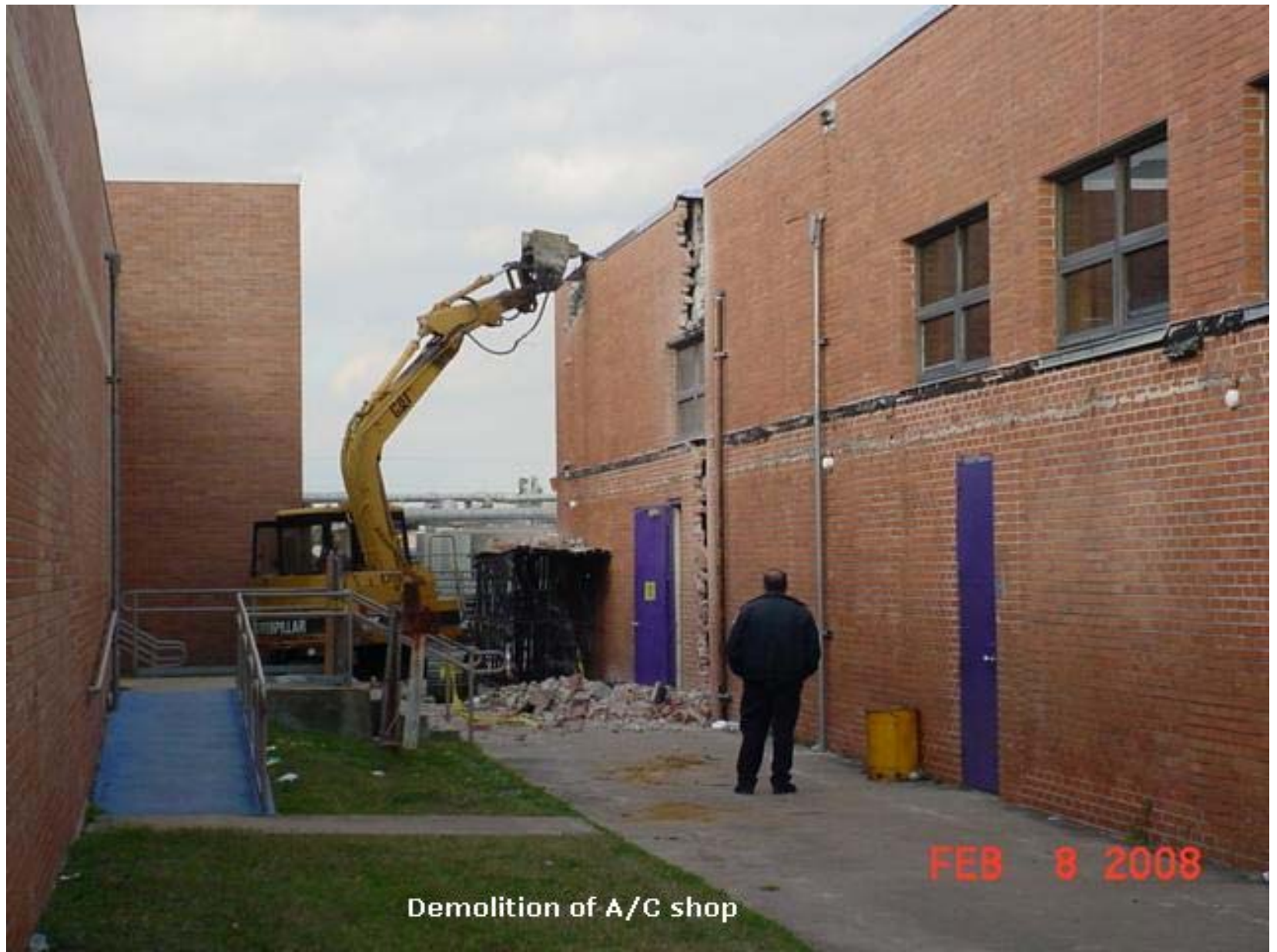
Demolition of A/C shop